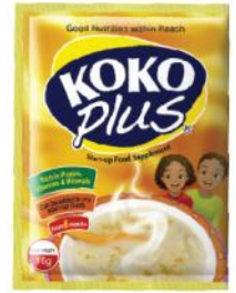
KOKO Plus™ (15g/sachet)

KOKO Plus™ is a rich mix of soya-bean powder, essential amino acids (especially lysine), vitamins and minerals (see Nutritional Information) and is designed for children aged 6-24 months. The product is in powder form and is to be added to complementary foods prior to feeding.